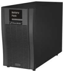
Battery Pack with inside 2x Battery Sets (Each battery set contain 8x 12V/7Ah batteries) Datasheet: Link Item No.: 10120567 Possible to connect more than one BP